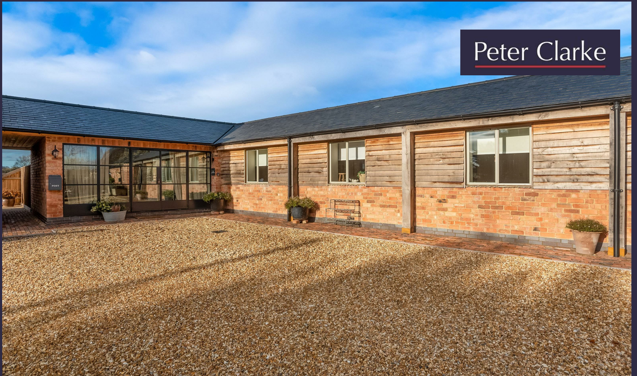
The Calf Pens, Littleworth Farm, Honington, Shipston-on-Stour, CV36 5EL